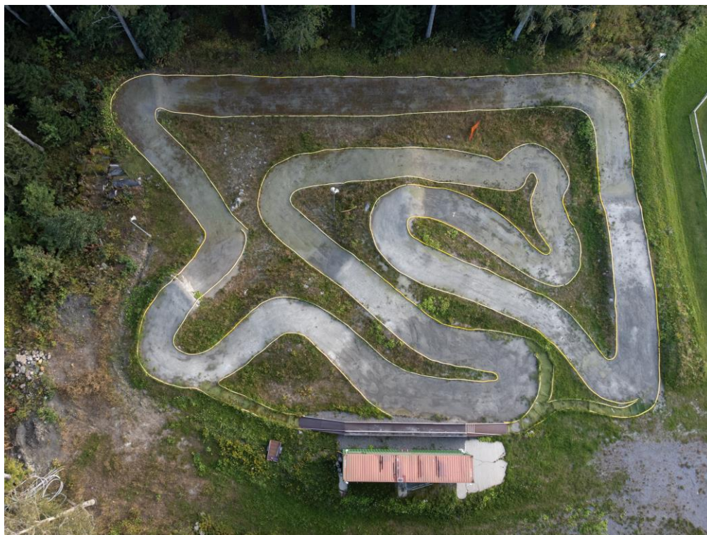
1/8 track layout

The track is closed from Friday 4th of August to Thursday 10 th of August.